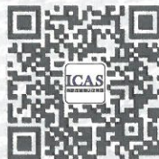
Focus on icas WeChat platform

Certification and Accreditation Administration of PRC:CNCA-R-2003-117 Tel: 400-182-9001/+86 21-51114700 Web: www.icas.org.cn Add: Room 801,HuaDing Mansion, 2368# West Zhongshan Rd., Xuhui District, Shanghai, China, 200235