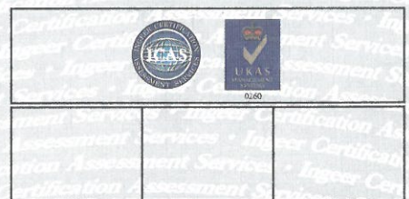
First Surveillance Audit Second Surveillance Audit Third Surveillance Audit

The ownership of the certificate belongs to Shanghai Ingeer Certification Assessment Co., Ltd. The information & validation of this certificate can be checked on the CNCA website: WWW.CNCA.GOV.CN and ICAS website, or by calling ICAS's clients services Dept. The certificate is only valid when used together with related permits when appropriate. If the organization can't effectively maintain the above management system, ICAS has the right to withdraw the qualification certificate.